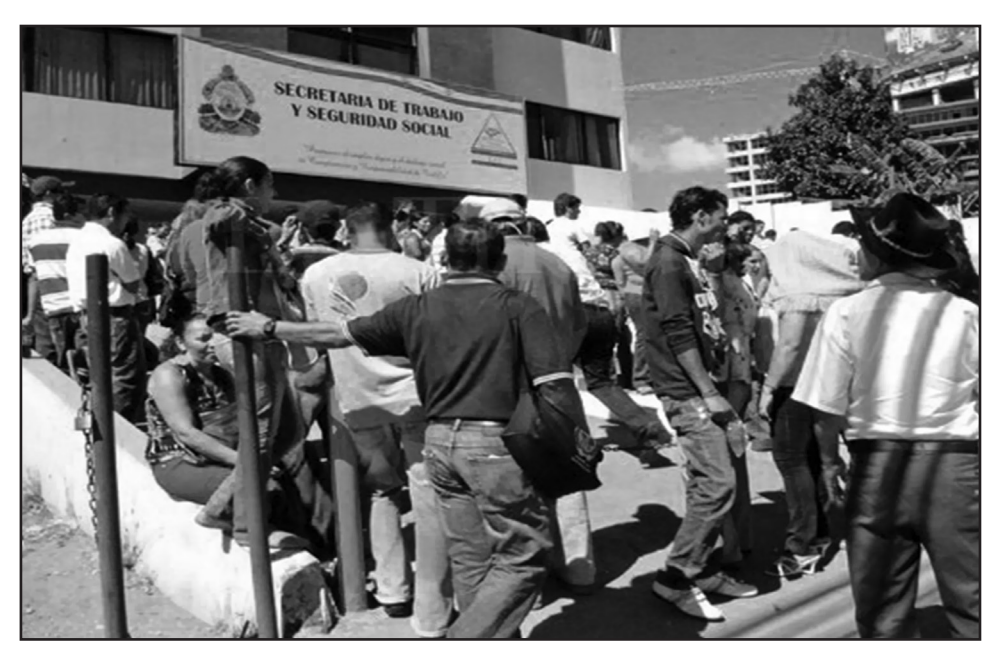
Union members in January, 2013 gather outside of the Labor Ministry office in Tegucigalpa, Honduras after unions released a set of proposals to address worker rights violations identified in the CAFTA labor complaint filed in March, 2012.