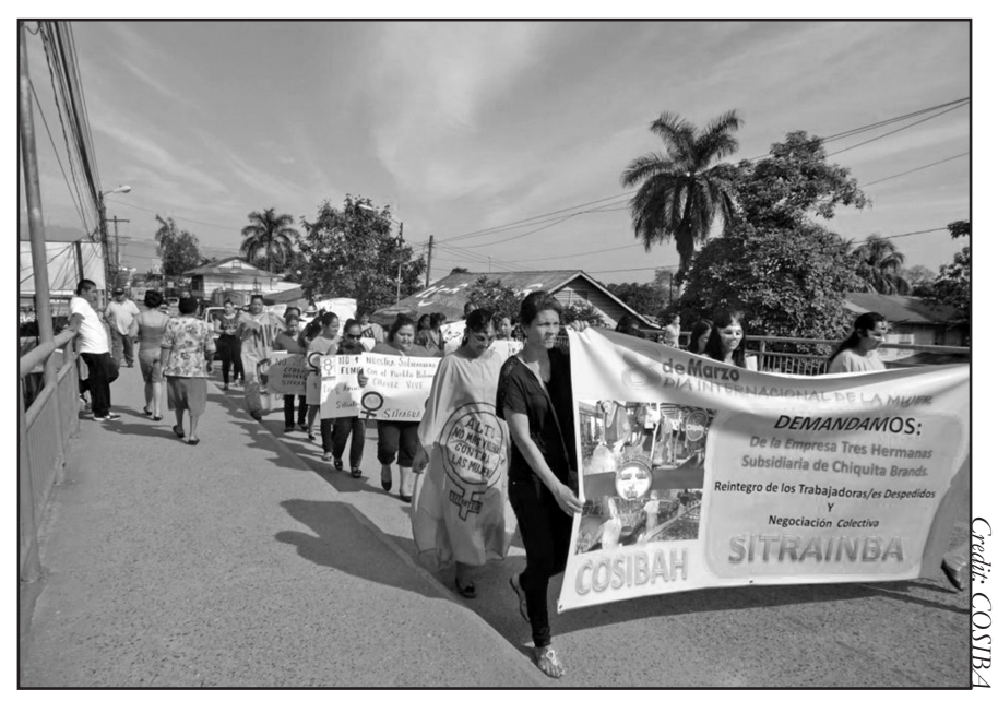
Members of the Coordination of Honduran Banana Unions (COSIBAH) march on International Women's Day in support of the Sintrianba union at the Three Sisters (Tres Hermanas) plantations.