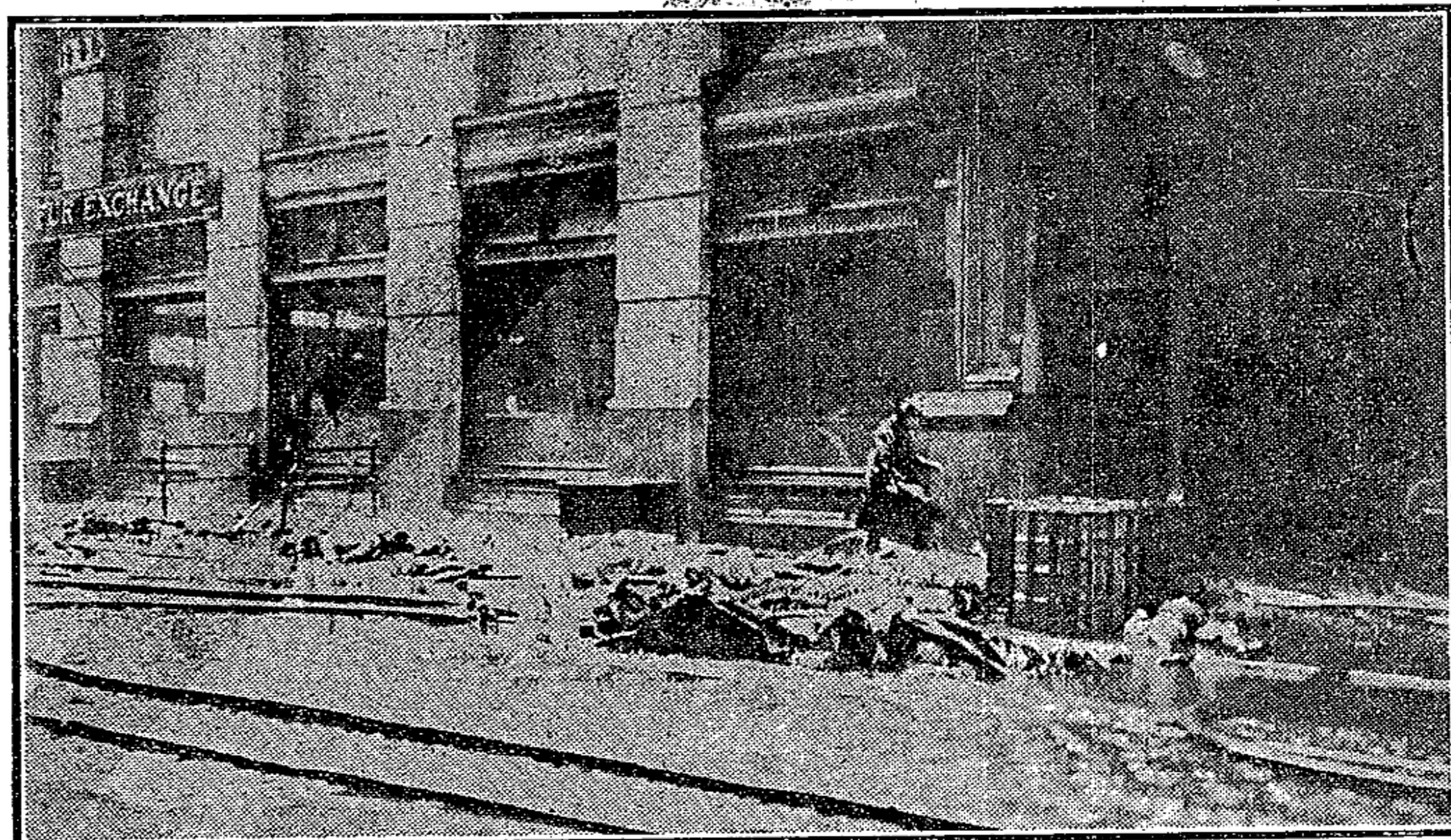
One Hour After This Picture Was Taken Two of the Victims Were Discovered to be Alive.

killed and burned to death were found principally on the ninth floor, where over 50 perished in front of a closed doorway, which they had jammed shut; in the two elevator shafts 30 or more were piled up in the bottom after the elevator had ceased running; at the bottom of a single iron fire escape in an air shaft in the building's rear and on the fire-proof stairways between the eighth and ten stories, up which the fire from the burning sewing machines on the eighth floor went with a rush of air toward the roof.