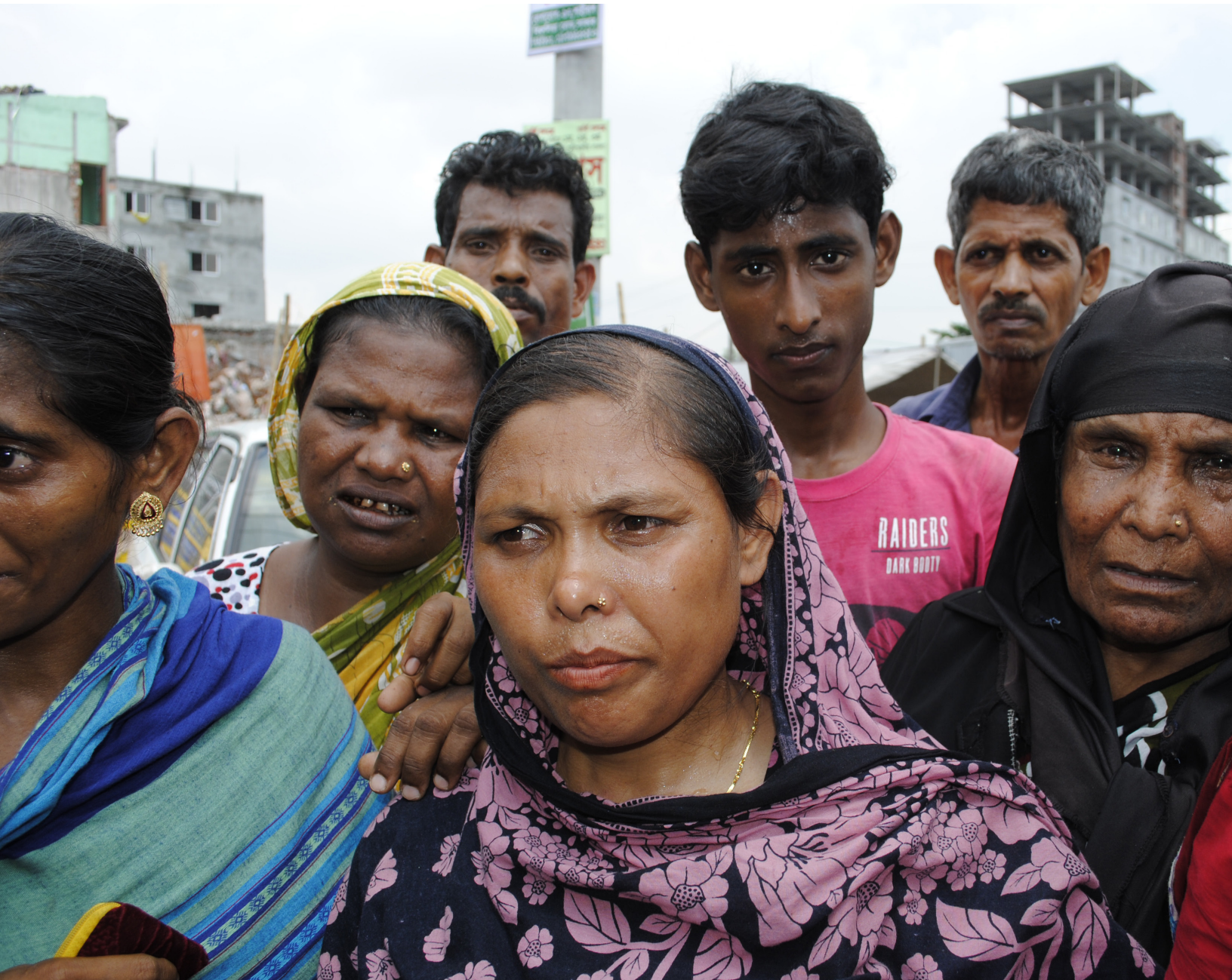
Affected family members.