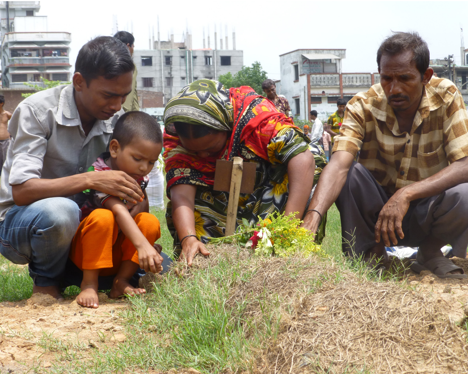
A family of a Tazreen garment worker visits the Jurain graveyard. They have yet to receive the full compensation due to them.