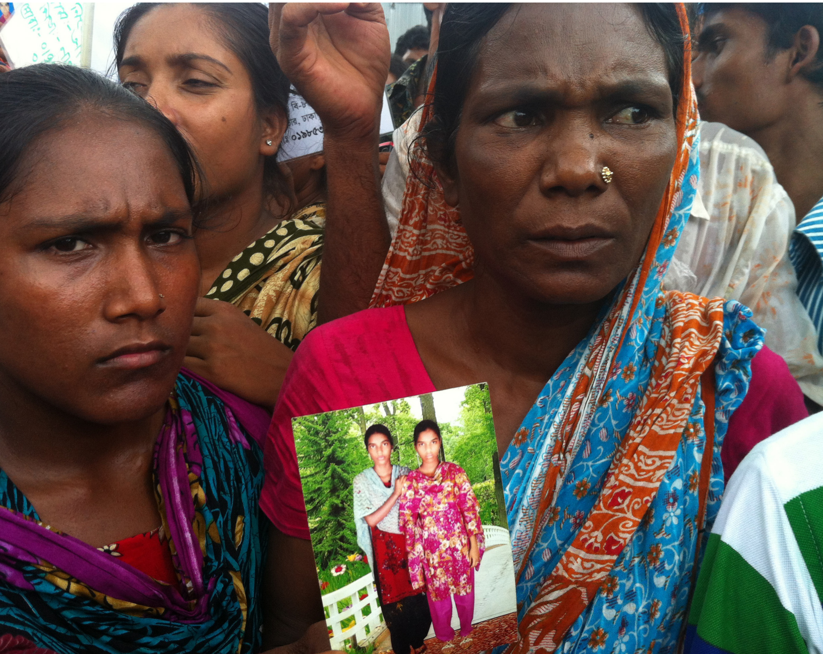
Family members of Rana Plaza building collapse victims.