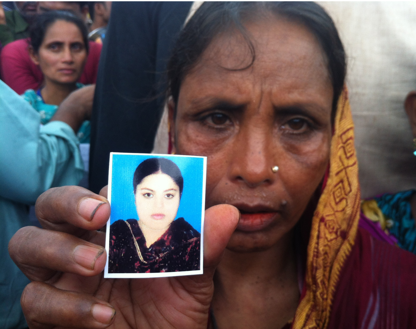
A mother mourns the loss of her daughter at Rana Plaza.