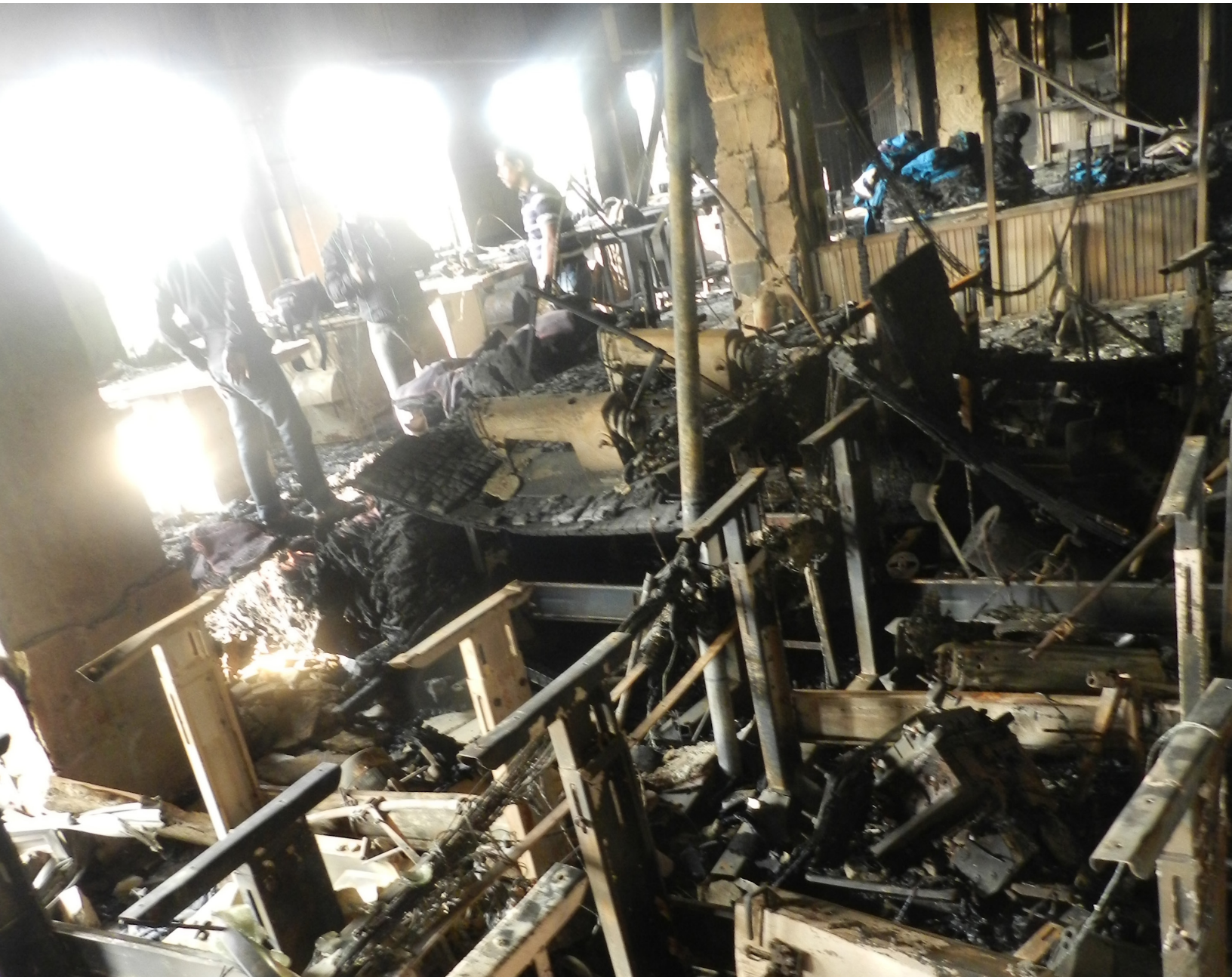
Inside Tazreen Fashions, the day after the factory fire.