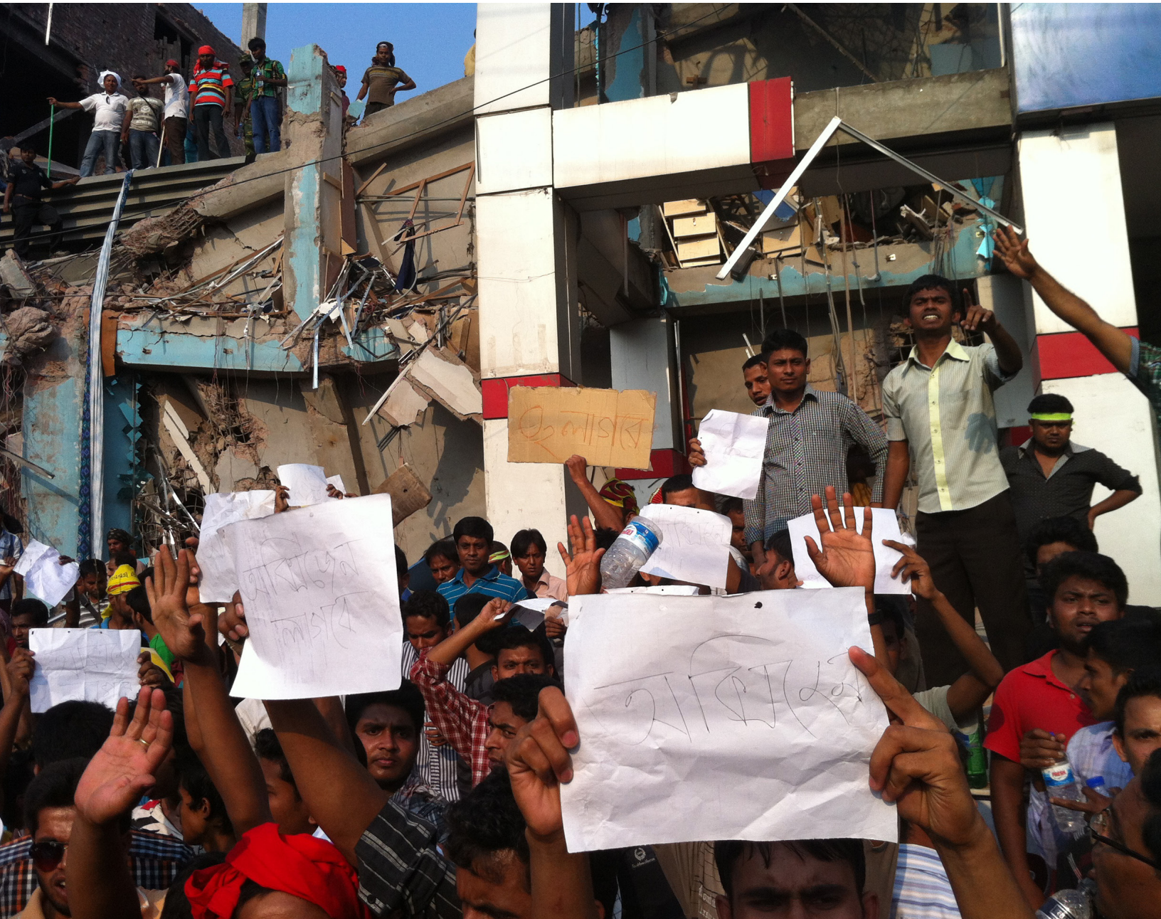
Amidst rescue efforts at Rana Plaza, workers call for help. © Laura Gutierrez