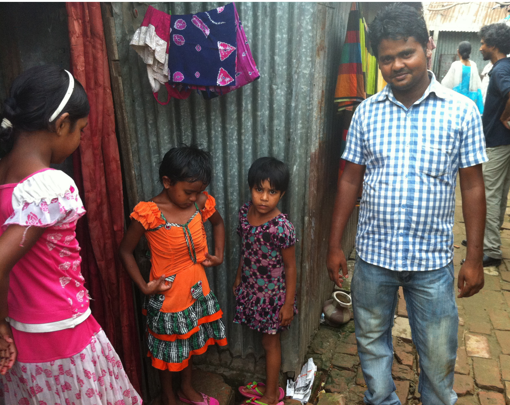
Garment workers live in concentrated housing communities. Many families live in one-room structures beside dozens of other families with whom they share common kitchen, water, and bathing areas.