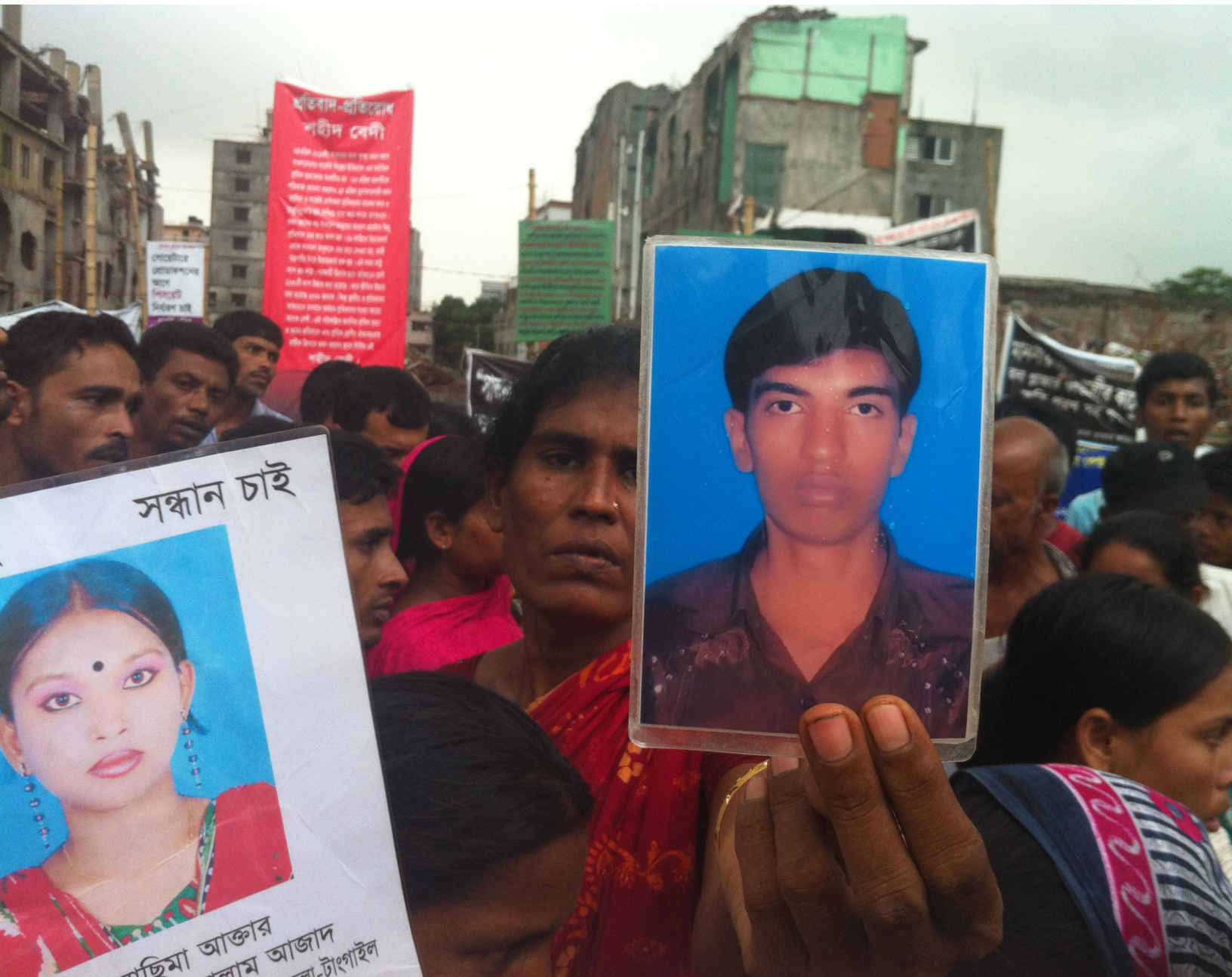
Demonstration in front of Rana Plaza on the International Day of Action to End Deathtraps, June 29, 2013.