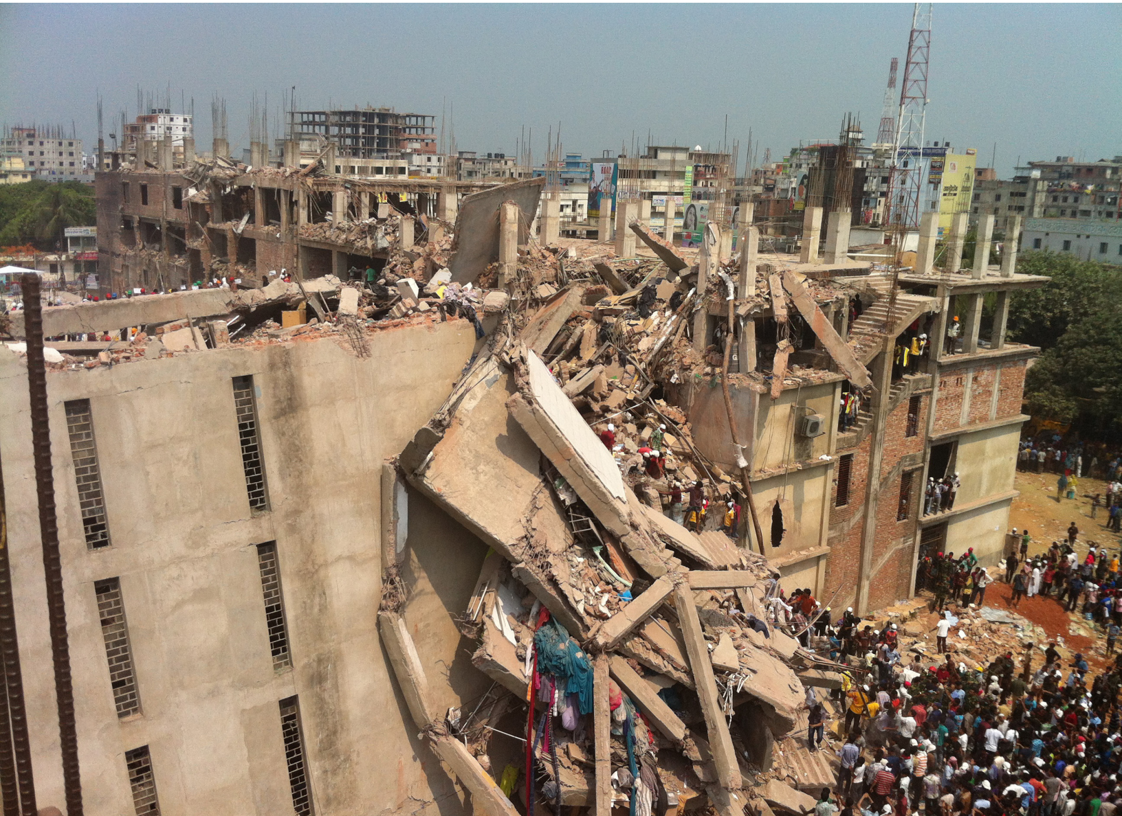
Rana Plaza building collapse, April 24, 2013.