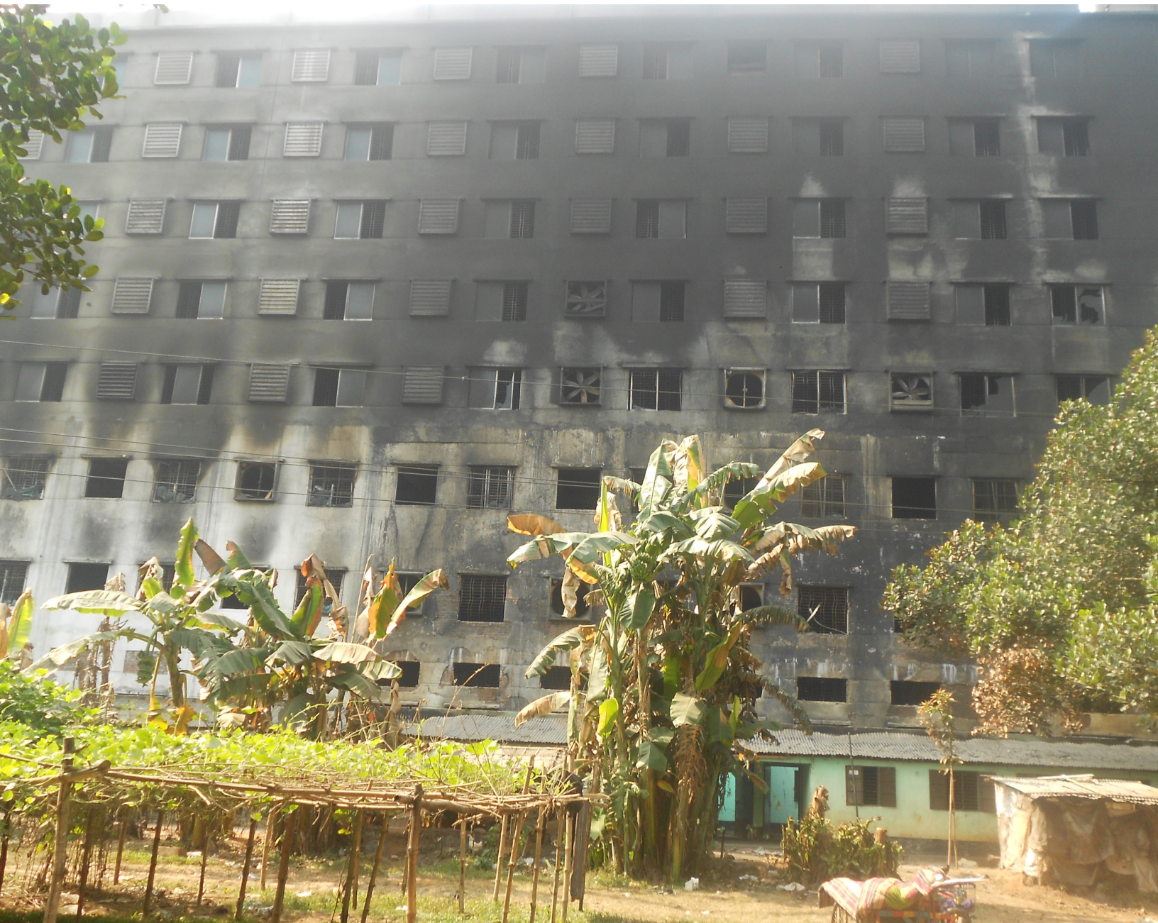
Tazreen Fashions factory, after the fire.