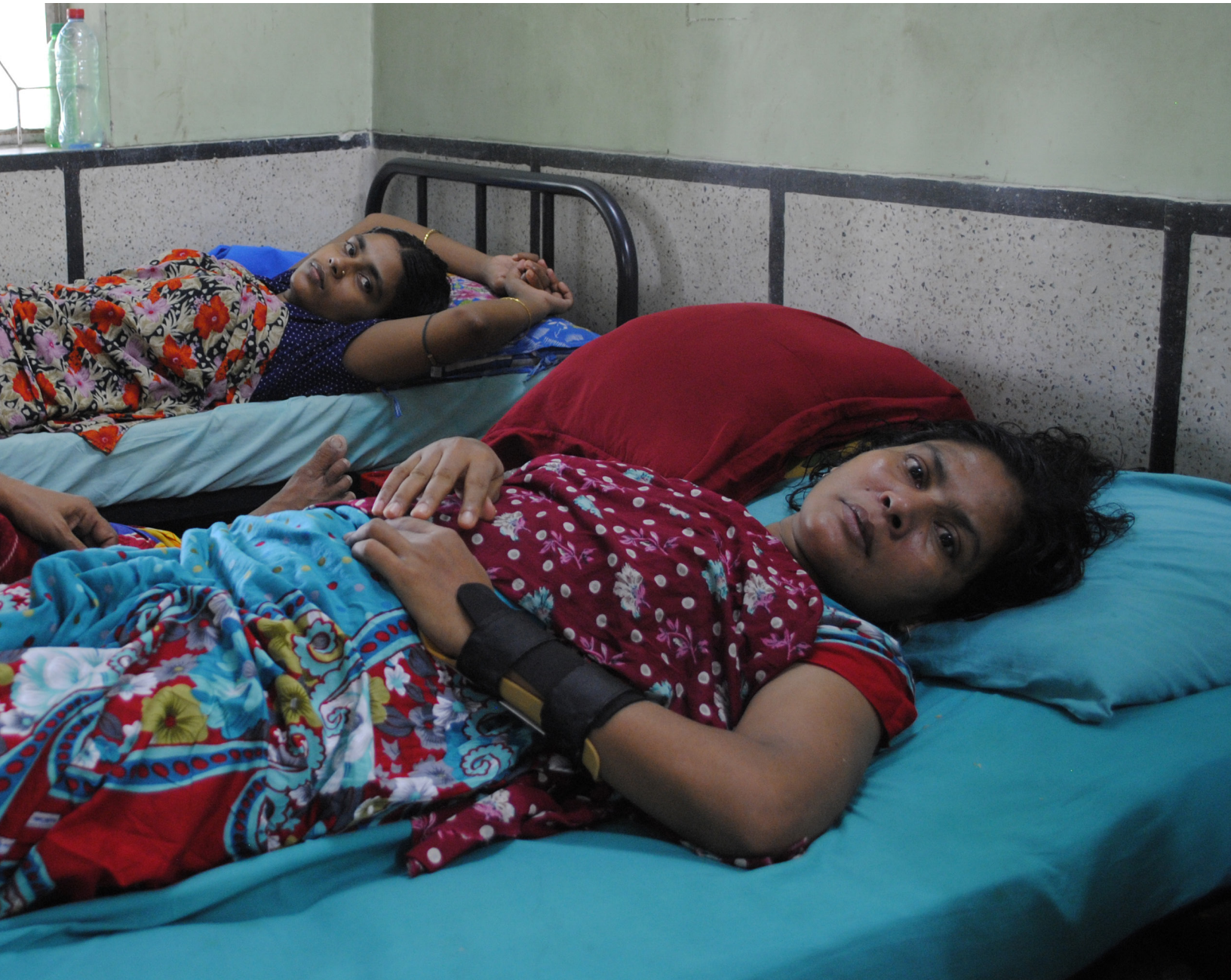
Workers who were injured in the building collapse.