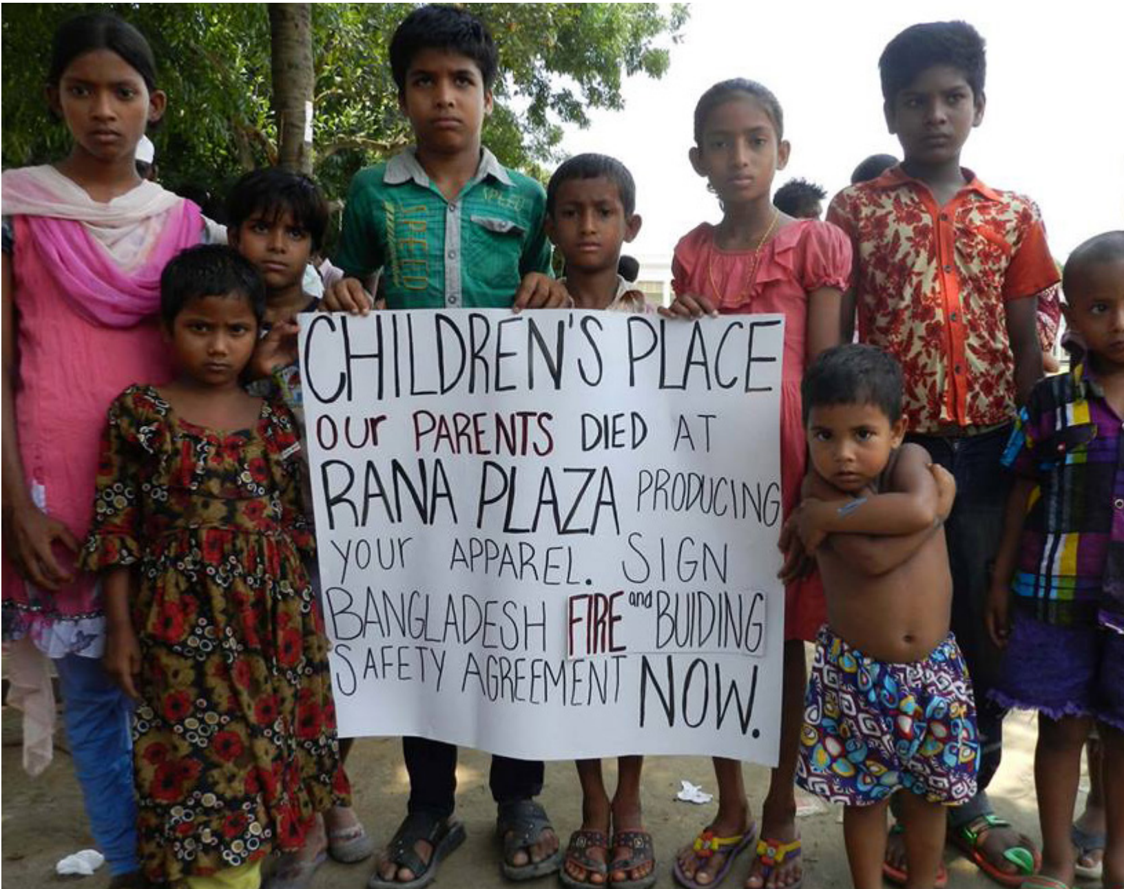
Orphans call on Children's Place to pay the compensation they owe and to sign onto the Safety Accord.