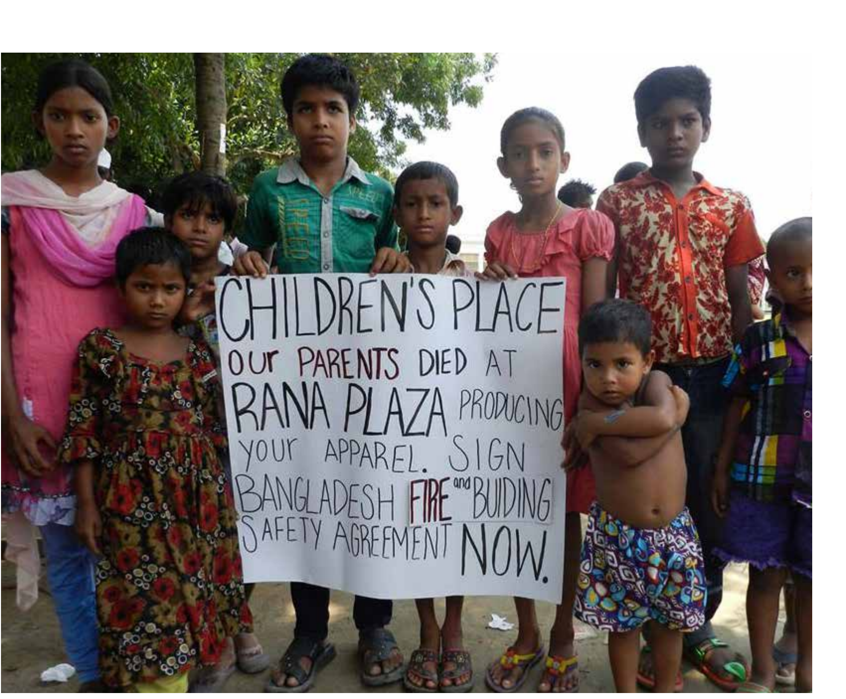
Orphans call on Children's Place to pay the compensation they owe and to sign onto the Safety Accord.

Bangladesh has long pursued the low road to industrialization, building a garment industry that has cut corners at every turn, underinvesting in infrastructure, worker safety and worker compensation. Global brands, which have continued to expand production, have helped fuel Bangladesh's low-road strategy. This strategy has secured Bangladesh its place as having the lowest paid garment workers in the world. It is also responsible for turning Bangladesh into the most dangerous place to be a garment worker.