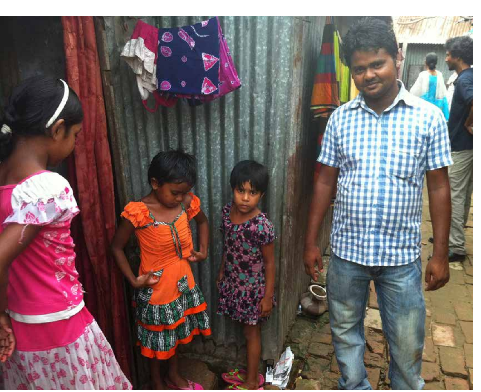
Garment workers live in concentrated housing communities. Many families live in one-room structures beside dozens of other families with whom they share common kitchen, water, and bathing areas.