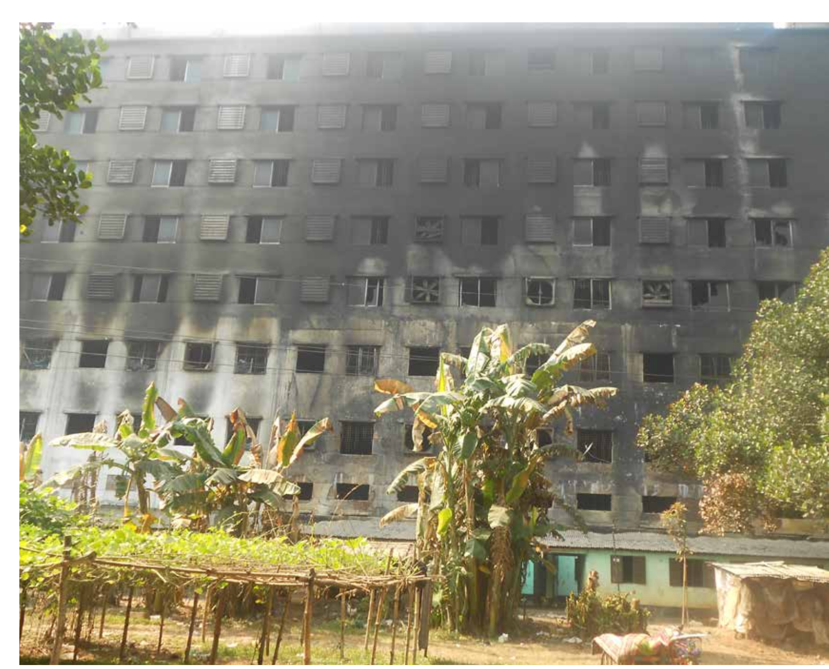
Tazreen Fashions factory, after the fire.