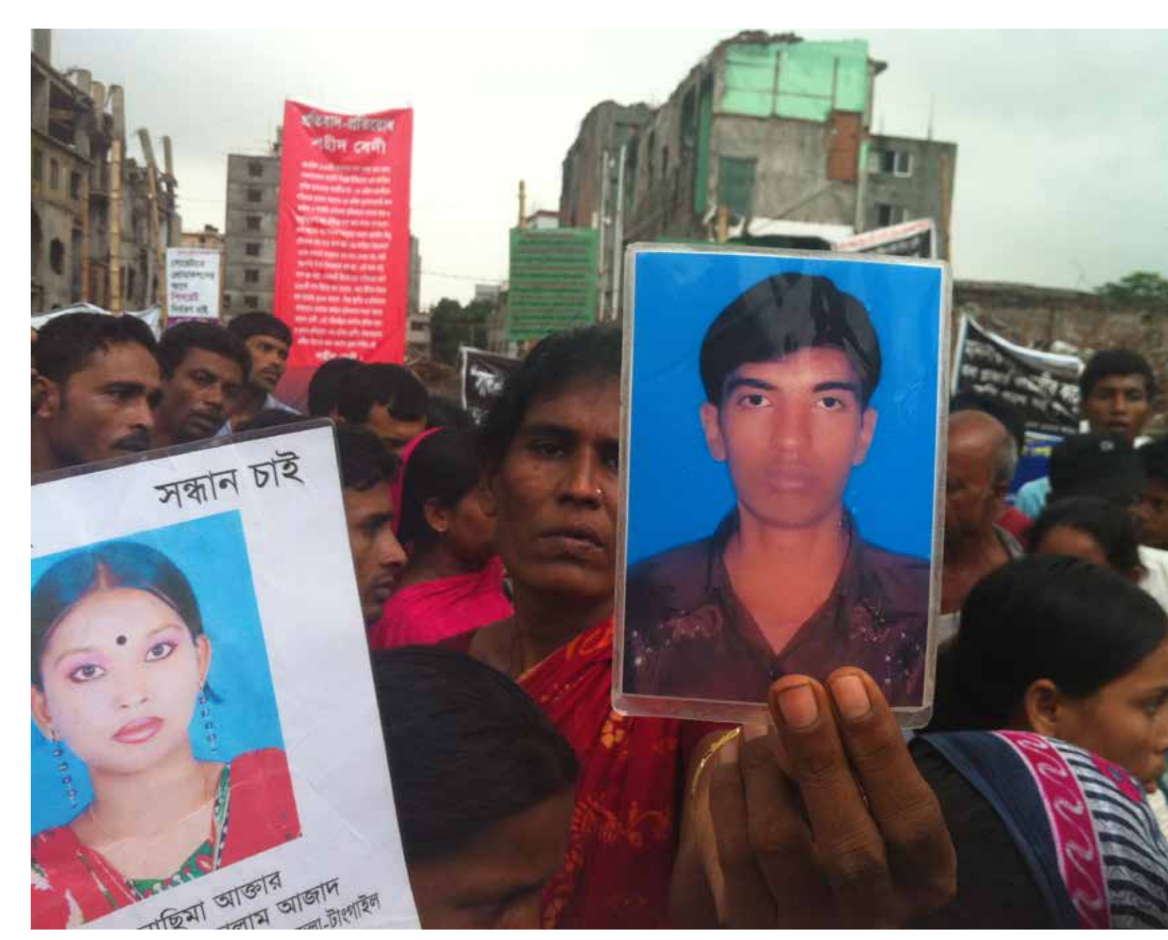
Demonstration in front of Rana Plaza on the International Day of Action to End Deathtraps, June 29, 2013

The ILO sent a high level expert delegation to Dhaka in the first week of October to discuss matters with the government and all stakeholders concerned.