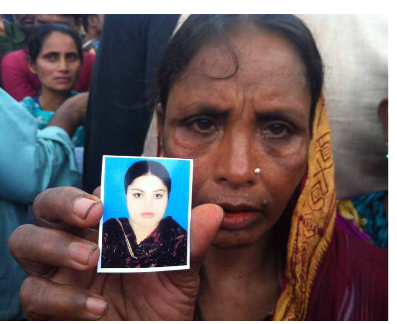
A mother mourns the loss of her daughter at Rana Plaza.