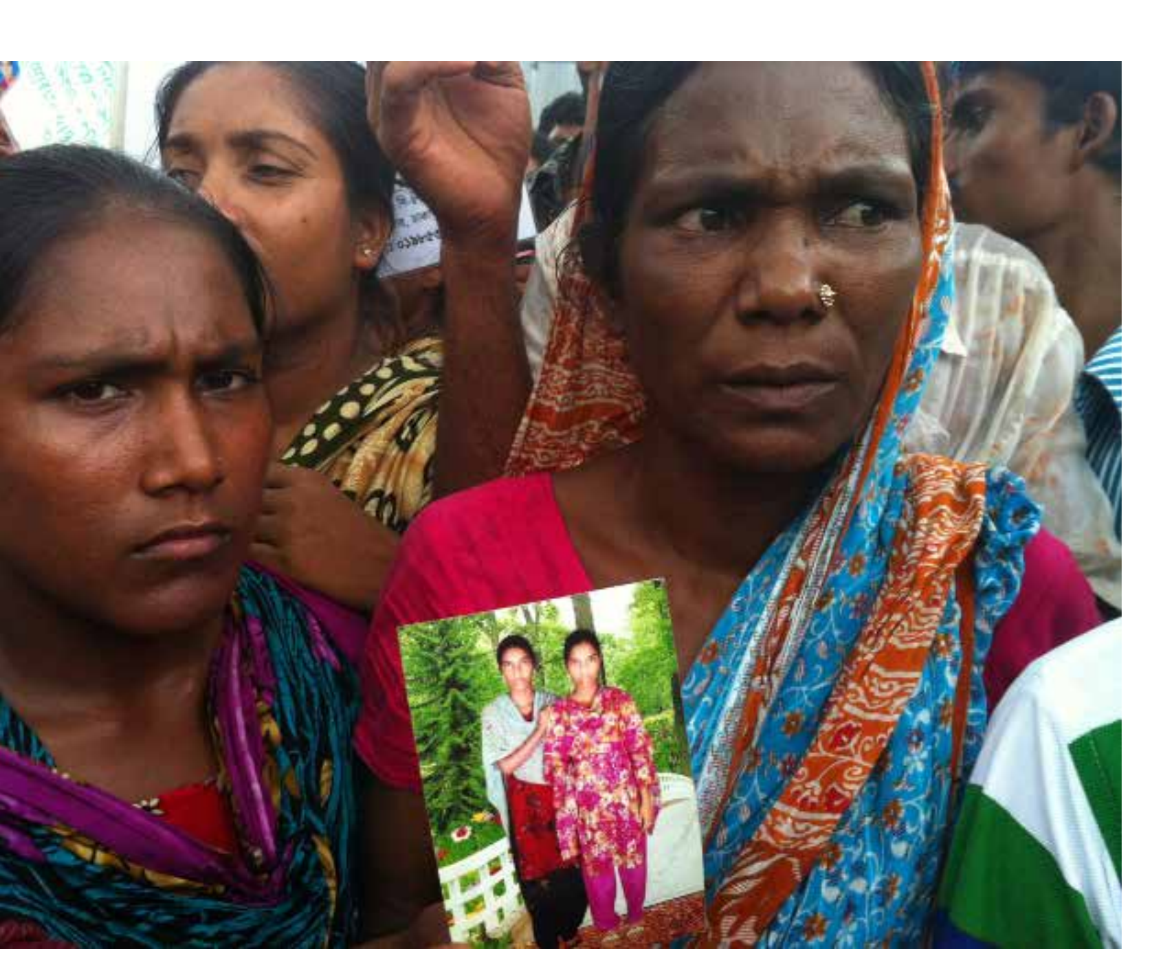
Family members of Rana Plaza building collapse victims.

On April 24, 2013, the Rana Plaza building in Dhaka, Bangladesh, which housed five garment factories, came crashing down, claiming at least 1,132 lives. Cracks had appeared in the wall the previous day, yet thousands of garment workers were forced to return to work in the factories housed on the upper floors.