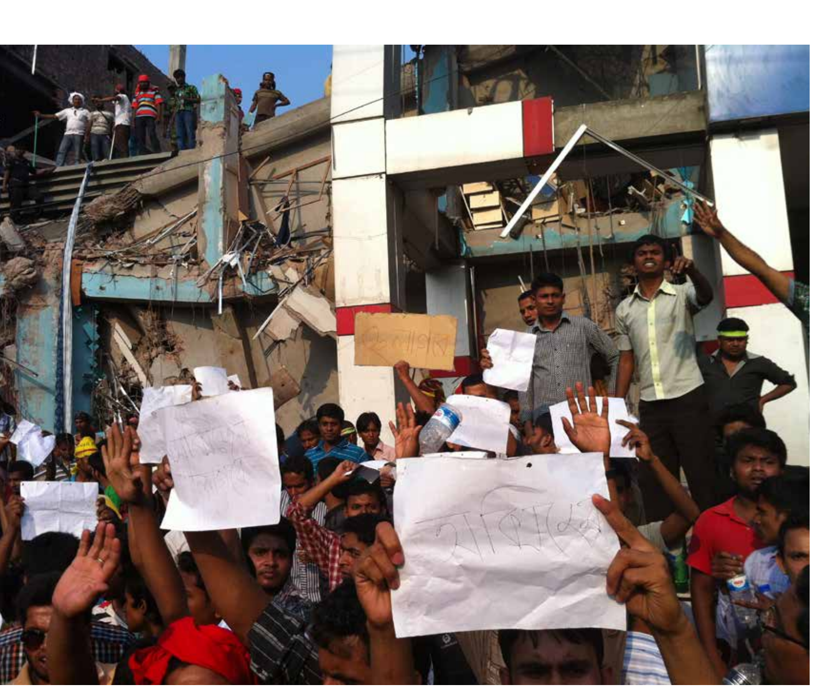
Amidst rescue efforts at Rana Plaza, workers call for help.

In addition to the compensation initiatives detailed above, in recent months several other initiatives have taken off in the Bangladesh garment industry in the areas of safety, labour law, and wages. This section summarizes key efforts in these areas.