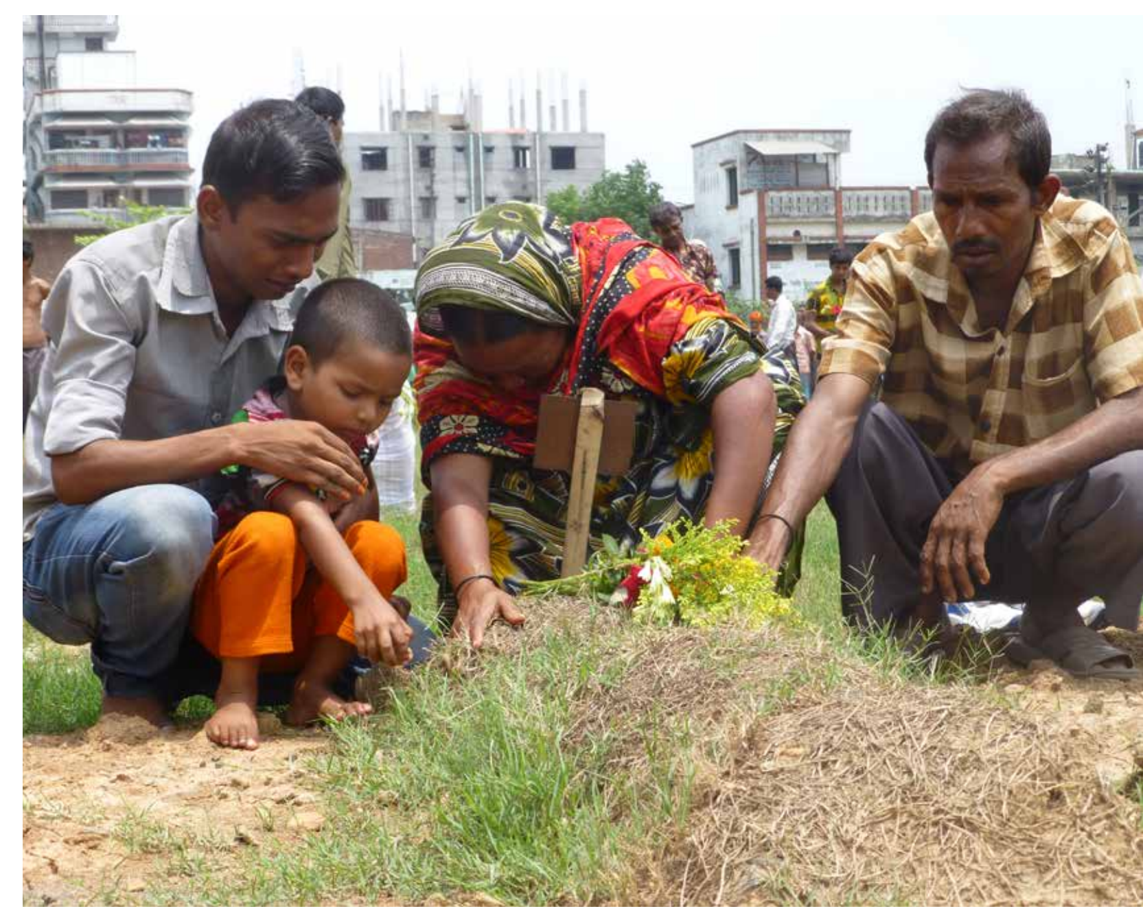
A family of a Tazreen garment worker visits the Jurain graveyard. They have yet to receive the full compensation due to them.