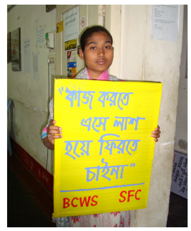
BCWS advocates for just restitution for the families of factory fire victims. This young garment worker holds a sign that reads: "Came to work. Don't want to go back as dead body."

in the United States in April 2010, Kalpona told audiences that the fires are not simply industrial accidents that could happen anywhere. "I would not say workers have died in the fires," she said. "I would say they have been killed." Searching for the root causes of the fires, the president of the National Garment Workers Federation commented: "I strongly believe that if you are really serious about preventing future deaths you must immediately start involving workers in monitoring health and safety standards. This can only be done through supporting the right to organise and working directly with trade unions."