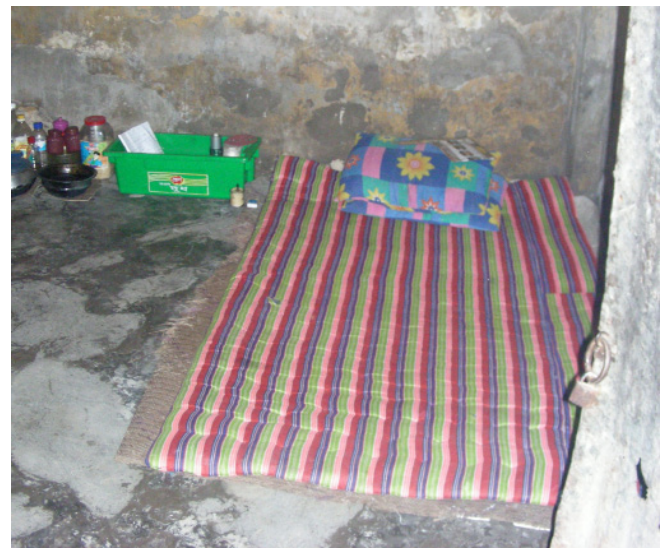
A thin mattress on the floor serves as a worker's bed.

The board met for the first time on January 24, 2010, but without a representative of the factory owners. Workers criticized factory owners for deliberately delaying the implementation of a new minimum wage.<sup>32</sup> When the owners finally joined the board on April 28, their opening offer was 1,875 taka, an increase of only 200 taka (US$3) per month. In May, they increased their offer to 2,000 taka, slightly above the 1,969 taka proposed by the Bangladesh Garment Manufacturers and Exporters Association (BGMEA).<sup>33</sup> Employers argued that they were squeezed by a slump in prices on the international market due to the global economic crisis and by higher production costs because of an energy crisis and poor infrastructure.<sup>34</sup> In June, media reported that