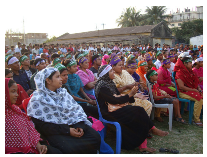
BCWS's daily work involves educating garment workers about their rights. This audience gathered to hear from BCWS on International Women's Day, March 8, 2010.

as criminals and troublemakers in the media.<sup>7</sup>