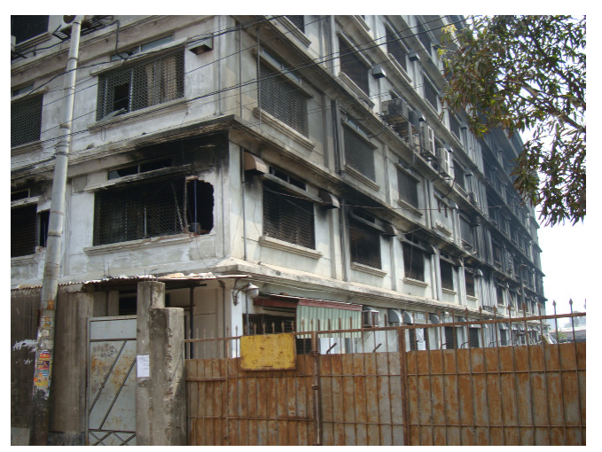
The fire started on the first floor of the Garib & Garib factory.

the Labor and Employment Ministry, the Bangladesh Garment Manufacturers and Exporters Association (BGMEA), and the Bangladesh Knitwear Manufacturers and Exporters Association. An official in the Prime Minister's office observed that "the WWC is a substitute for the trade union as lack of any representation from RMG workers in their working places causes much frustration among them, which sometimes bursts into violence."19