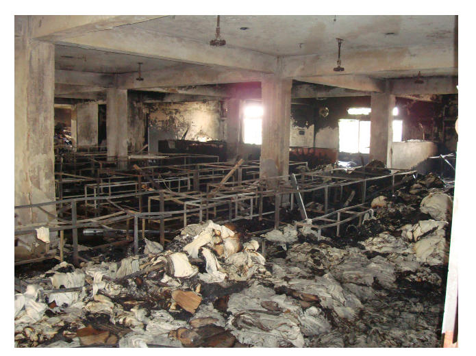
All the workstations and goods on the first floor of Garib & Garib were completely destroyed by the fire.

However, the roots of worker "frustration" are not addressed effectively by worker welfare committees, which have no power to represent workers' genuine interests or negotiate improved wages, benefits, or workplace conditions. While trumpeting the ability of the new workers' welfare committees to "address the legitimate problems of garment workers,"20 Abdus Salam Murshedy's BGMEA also insisted on continued poverty wages for the garment workers, suggesting they should be raised a mere 200 taka, from 1,662.50 taka (US$24) to 1,969 taka per month, at a time when the workers demanded 5,000 taka.<sup>21</sup> Nor would the worker welfare committees be able to organize worker actions to ensure compliance with wage laws. According to a June 2010 Bangladesh Fac-