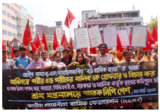
Garment workers protest factory fires and call for safe and healthy working conditions with decent wages. Photo: NGWF, March 30, 2010.

The first minimum wage for garment workers, established in 1985, was only 621 taka ($9) per month.<sup>13</sup> Five years earlier, in 1980, Bangladesh had adopted the Foreign Private Investment Promotion and Protection Act, establishing exportprocessing zones (EPZs) to stimulate rapid export growth. The Bangladesh Export Processing Zones Authority (BEPZA) was granted immunity from 16 laws relating to industry, labor, and customs issues, including the Industrial Relations Ordinance of 1969 which guarantees workers freedom of association. Instead, special "instructions" gave workers in the export-processing zones the right to be paid the minimum wage for a 48-hour work week, receive a 10 percent annual increase in gross wages, and take a certain number of days off from