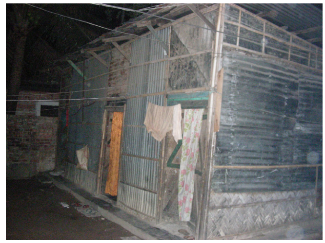
A garment worker's home, made from scrap metal and wood.

"panic gripped the country's 4,500 garment manufacturers" as unions threatened a nationwide nonstop protest for the 5,000 taka minimum wage.<sup>35</sup> But owners stuck to the position that depressed prices, caused by global recession, and production losses, caused by a gas and electricity supply crisis, made it impossible for them to make any substantial increase in workers' wages. The owners insisted they could go no higher than 2,500 taka (US$36) per month and still maintain competitiveness.<sup>36</sup>