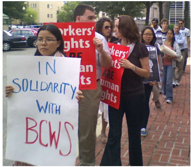
Labor activists rally in front of the Bangladeshi Embassy in Washington, DC, in support of the Bangladesh Center for Worker Solidarity.

campaign against BCWS, arrested its leaders, and falsely charged them with participating in and fomenting worker unrest and violence, the international community of labor rights and human rights advocates responded rapidly. Labor rights groups launched urgent action alerts in the United States, Canada, and across Europe. Human Rights Watch wrote a well-publicized letter of protest to Prime Minister Hasina of Bangladesh and Amnesty In-