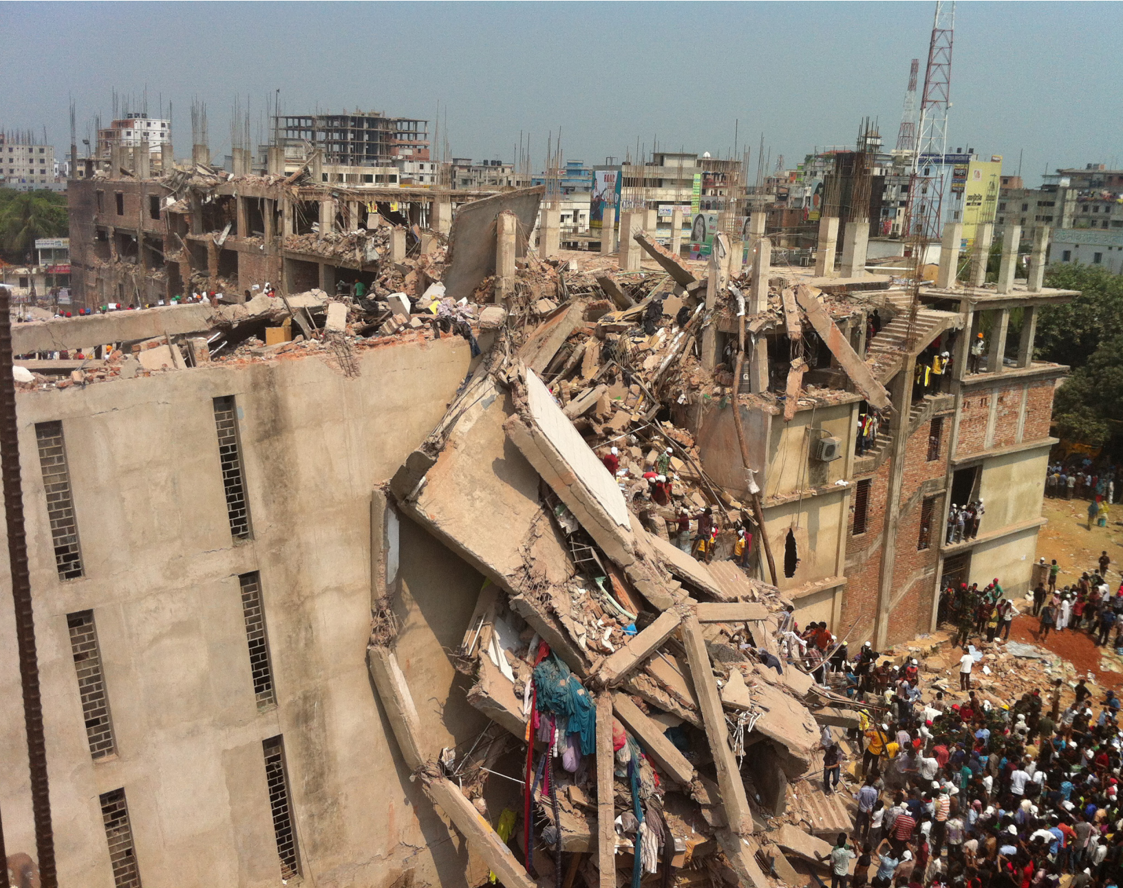
Rana Plaza building collapse, April 24, 2013.