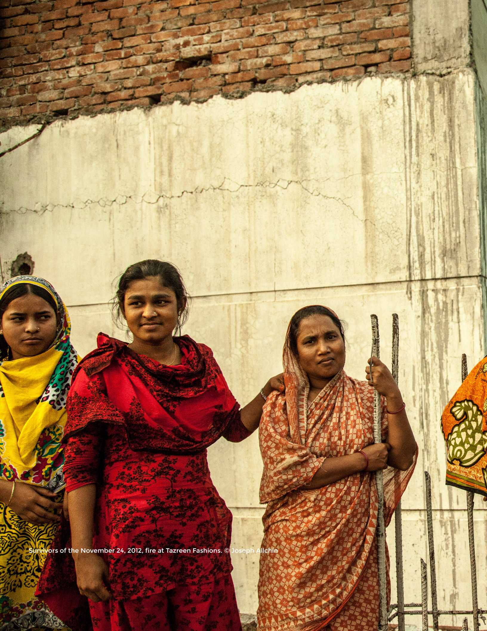
Survivors of the November 24, 2012, fire at Tazreen Fashions.