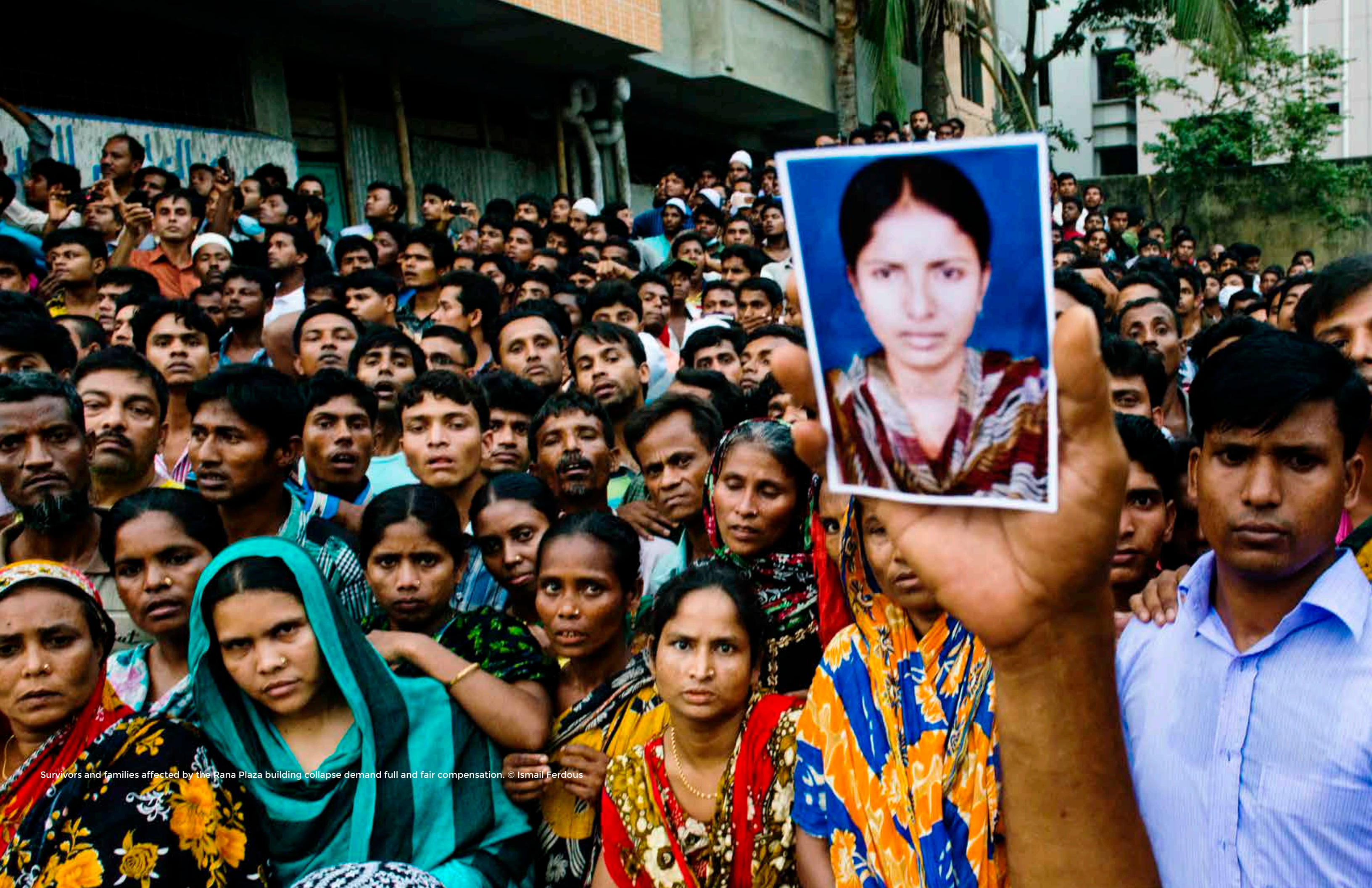
Survivors and families affected by the Rana Plaza building collapse demand full and fair compensation.