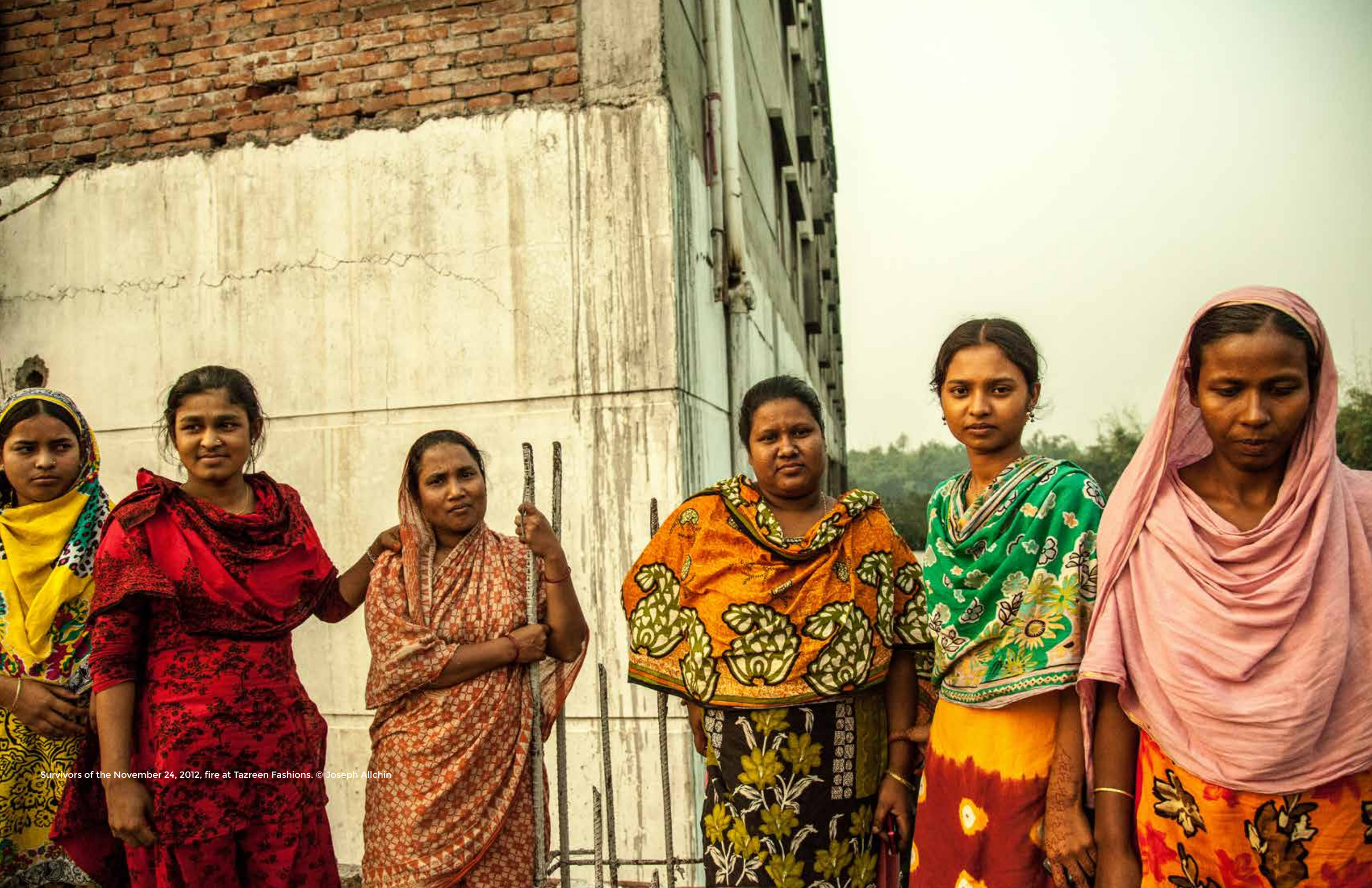
Survivors of the November 24, 2012, fire at Tazreen Fashions.