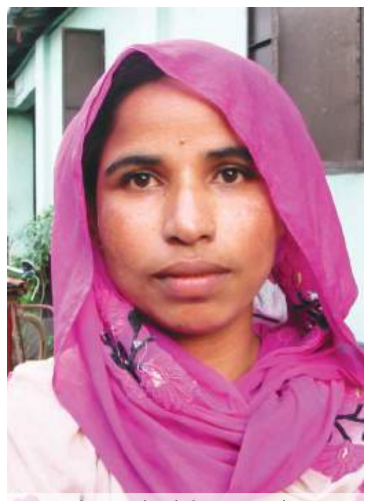
A Rana Plaza survivor in her community.

program's aims, as well as providing a vehicle for monitoring and addressing safety and health issues on an ongoing basis. There is also a training program for workers, with the involvement of trade unions and specialized local experts. The purpose of the program is to empower workers and support factory management to take ownership for keeping their factory safe. Accord. At the moment of this writing, the Accord had conducted 2,838 factory-based Safety Committee training sessions, and 219 participating factories had gone through the complete 7-session training program. In addition, the Safety and Health Complaints Mechanism had resolved 197 complaints. A total of 614 complaints have been filed through the mechanism, 184 of which were non-health and safety related. One hundred and twenty-four complaints were under investigation.<sup>87</sup>